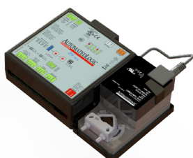
● Figure 1: Physical Dimensions