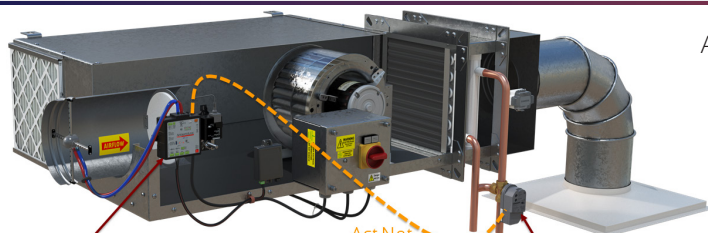
Automated Logic damper controller