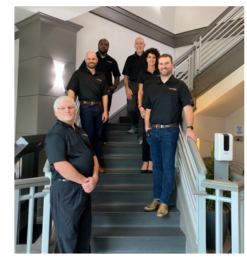
Automated Logic Green Team