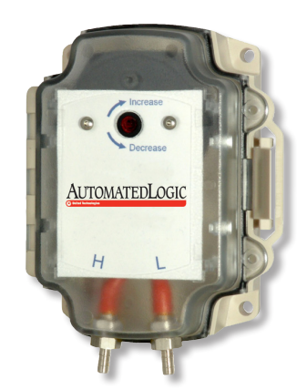
Differential Pressure Switch

The unit features a rugged plastic enclosure that protects the electrical terminations and pressure adjustment screw which is easily accessed through a port in the front cover using a square screwdriver bit. The quick connect wiring terminations are accessed by opening the hinged cover. The unit is very compact and can be mounted directly on a flat surface with the rugged mounting feet, and the pressure barbs accept 3/16" or 1/4" tubing.