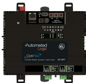
Figure 1: Physical Dimensions