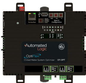
● Figure 1: Physical Dimensions