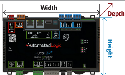
● Figure 1: Physical Dimensions