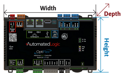
Figure 1: Physical Dimensions